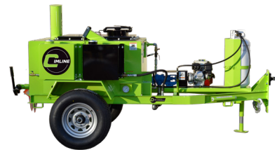
K-Series Emulsion Applicator