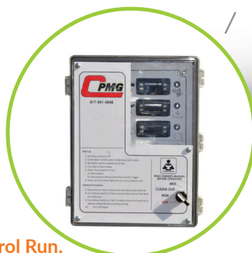
Simple Control Run, Clean Out, Mix