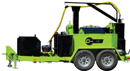
M-Series Crack Sealers