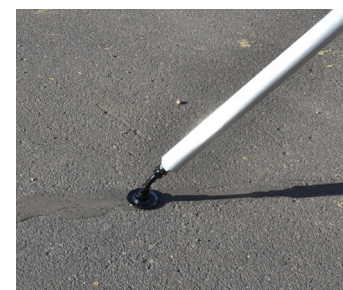
Electric Heated Wand