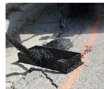
Standard Applicator Box